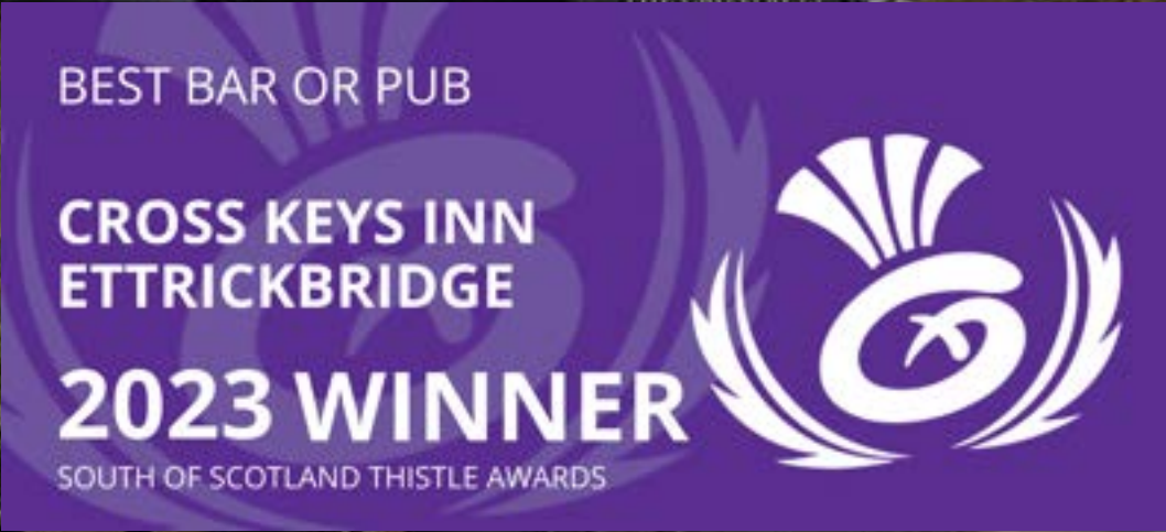
Rory Steel, Cross Keys Inn Ettrickbridge